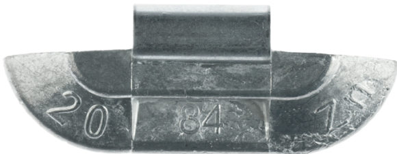
Series 84U - Zinc Uncoated - For steel wheels

With a legacy of delivering new ideas to the industry, we have done it again.