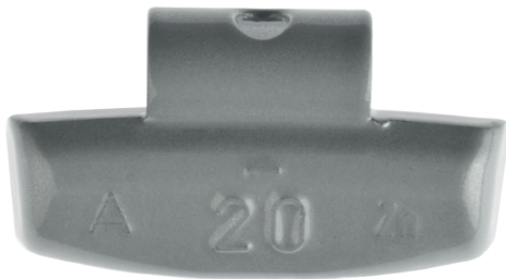
Series 63 - Zinc Coated - For alloy wheels